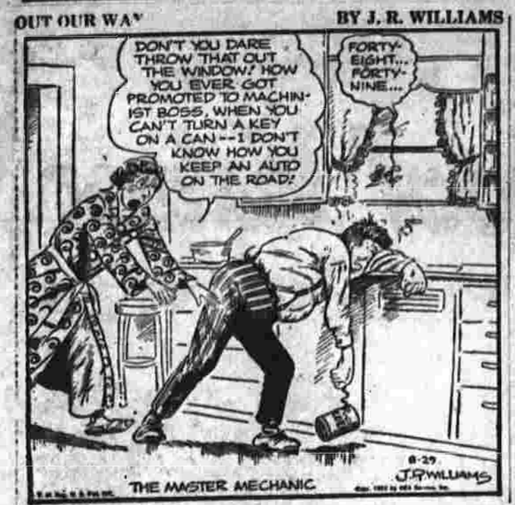
OUT OUR W BY J.R. WILLIAMS