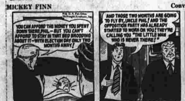
MICKY FINN BY LANK LEONARD