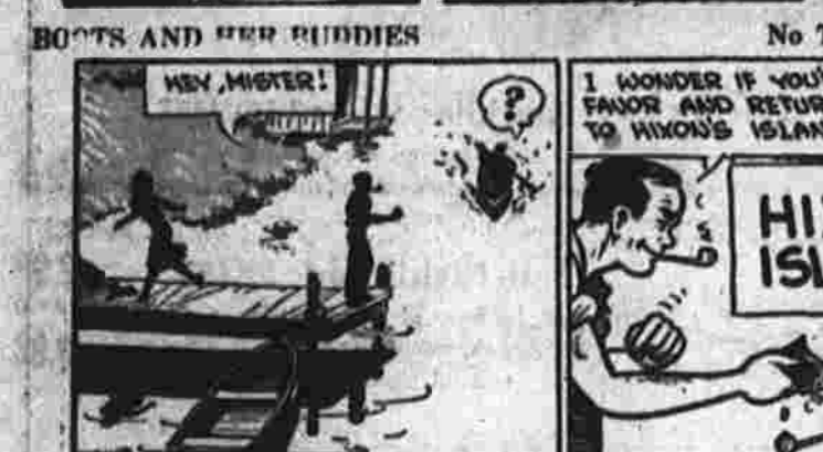
HIXON'S ISLAND? BY RUSS WINTERBOTHAM