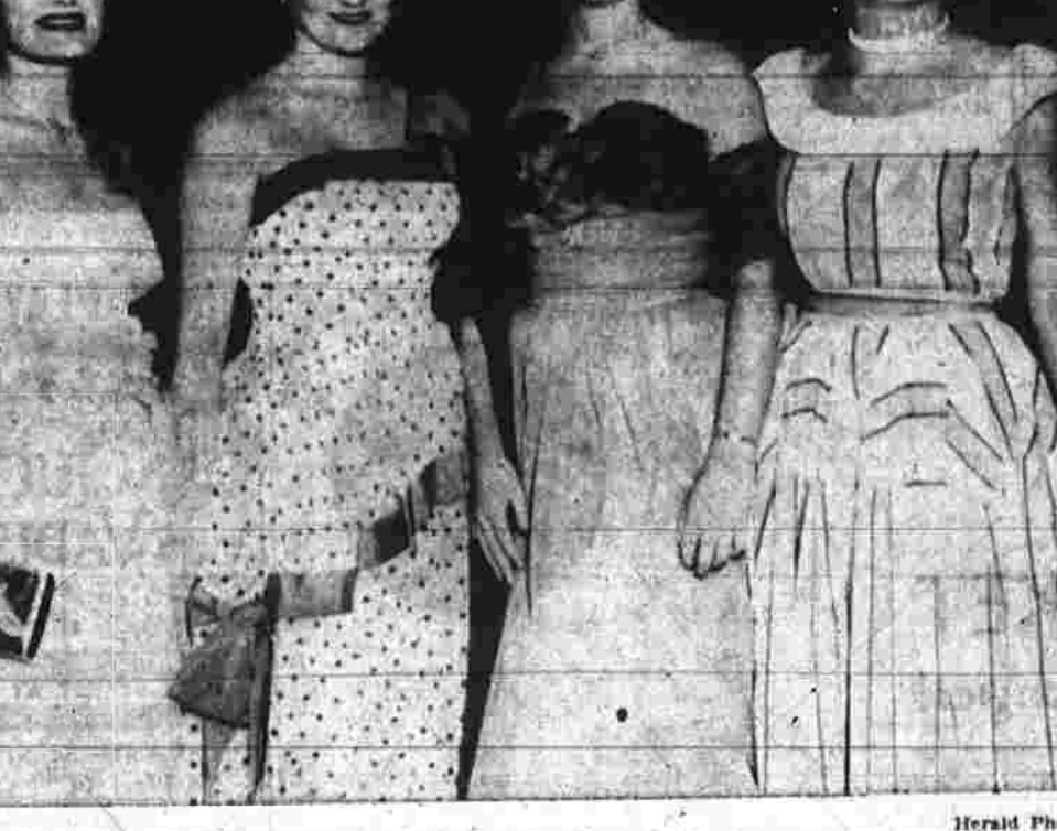
These four young juveniles were chosen last night as the queen's attendants at the Manchester Cigar Harvest Festival.

Aircraft Will Build Ramjets For Navy Missiles. East Hartford—Pitt & Whitney began jet production four years ago with its centrifugal-flow Turbo-Whip turbojet.