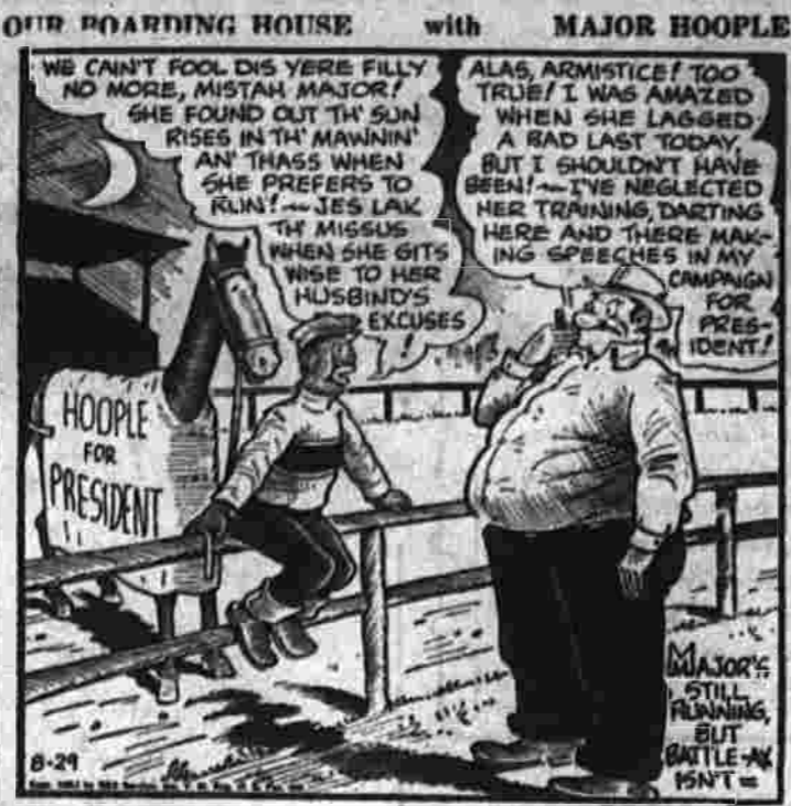
OUR BOARDING HOUSE with MAJOR HOOPLE BY J.R. WILLIAMS